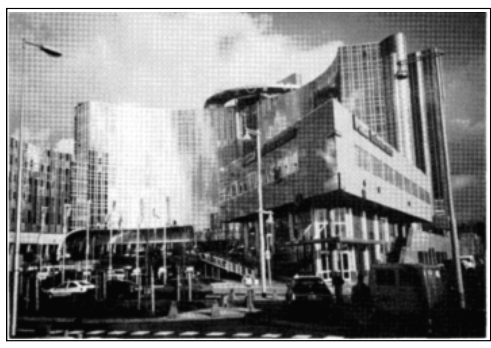
Amsterdam Teleport Netherlands PTT is part of the planned six million square foot development.

Telecommunications infrastructure is changing the way landowners, service providers, and the public sector view real estate and planning for industrial community development. Comparisons to water pipe capacities, sewer lines, hydro and gas lines, and street capacities are inevitable. Governments and developers have been able to build communities in the past based on a foundation of services that has been in place, or helped to initiate this infrastructure as a result of a proposed development.