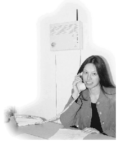
Figure 2 Fixed Wireless Terminal (FWT)

Another key feature for the Hungarian telecommunications network operator is the ability to transmit billing pulses from the central switch. This important feature enables the system to support both coin and card-operated payphones.